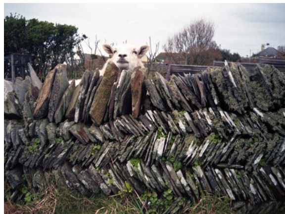
Cornish hedge near Tintagel

Find out more about Cornish hedges by visiting the website of the Cornish Hedges website - http://www.cornishhedges.co.uk/