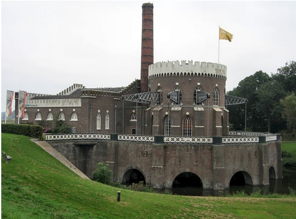
Cruquius Pumping Station - showing some of the Cornish beam engines.

http://www.cruquiusmuseum.nl/englishsite/engine.html