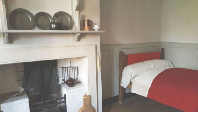
Inside one of the almshouses