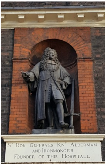
Statue of Cornishman Robert Geffrye at the Geffrye Museum