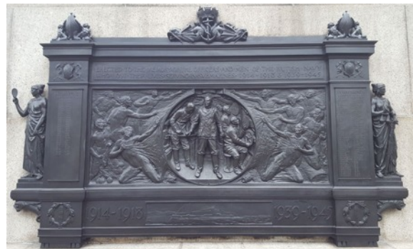
The National Submarine War Memorial on the Victoria Embankment in London which commemorates those sub-mariners who died in both world wars.

http://navaltoday.com/2017/02/01/historic-england-shares-never-before-seen-photos-of-german-wwi-submarines/